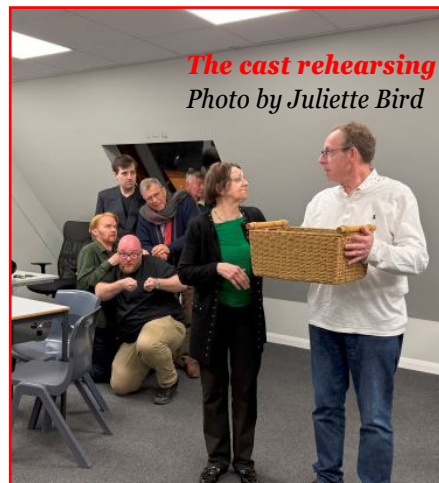
The cast rehearsing